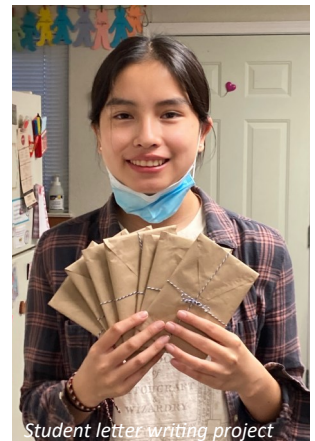
Student letter writing project