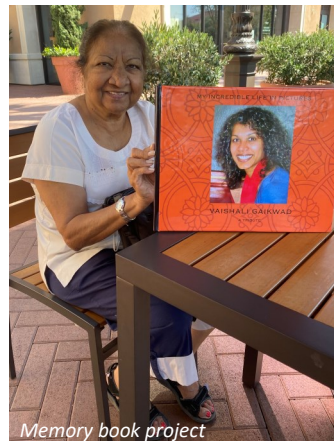
Memory book project